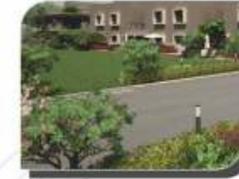
C.C SURFACE INTERNAL ROADS