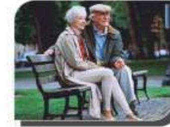
SENIOR CITIZEN SITTING SPACE