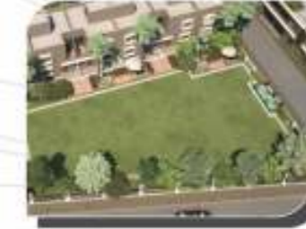
LARGE COMMON PLOT