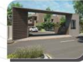
DECORATIVE MAIN ENTRANCE GATE