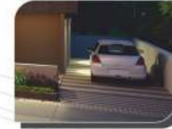
INDEPENDENT PARKING SPACE FOR EACH UNIT