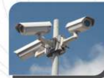
CCTV - SURVEILLANCE