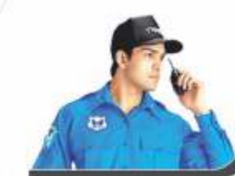
DAY & NIGHT SECURITY SERVICE